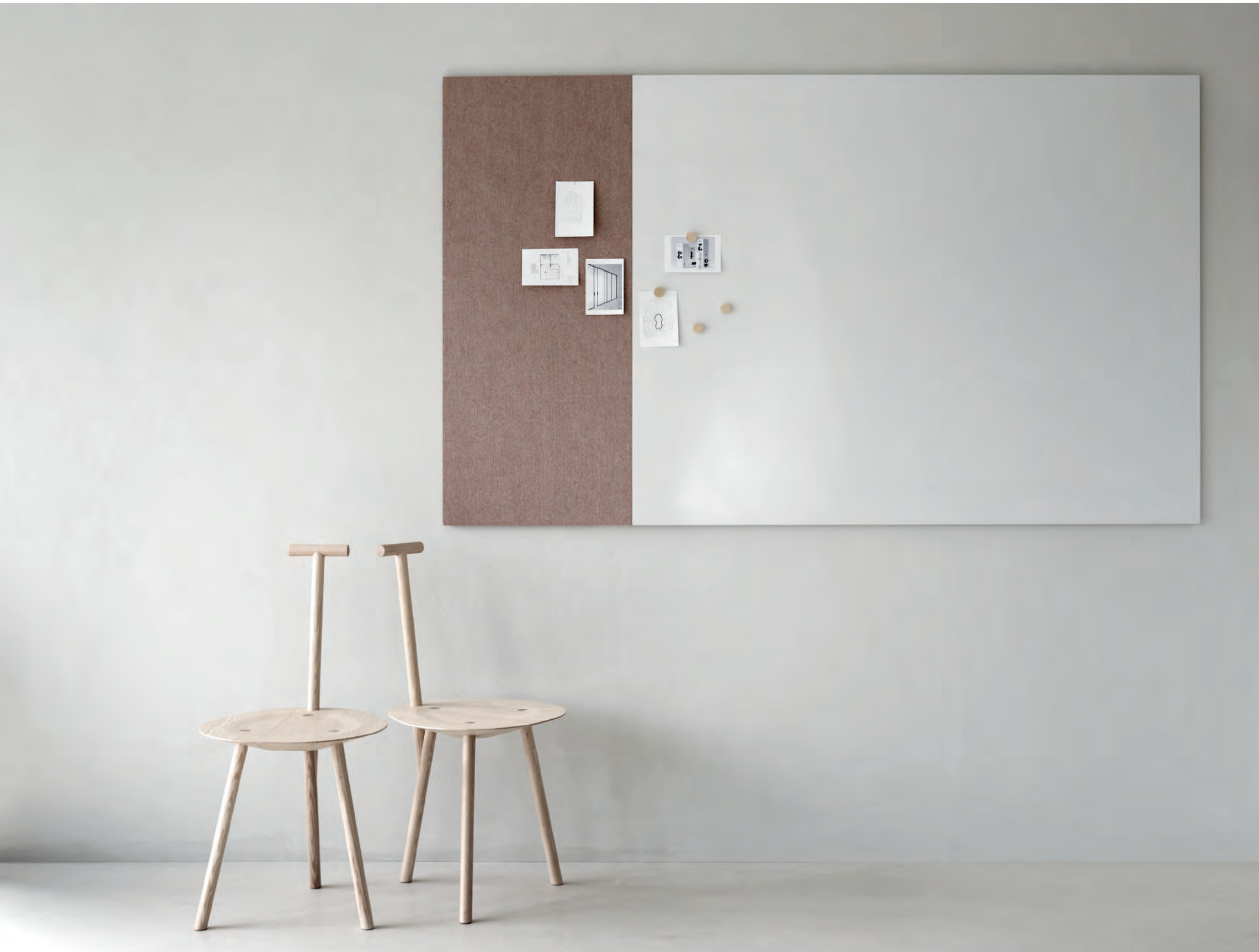
Air Textile Combined with Air whiteboard.

A soft textile noticeboard designed to supplement our ceramic steel whiteboards. Air Textile can be mounted on either side of an Air whiteboard or between boards in Air Spaces. Available in several different textiles.