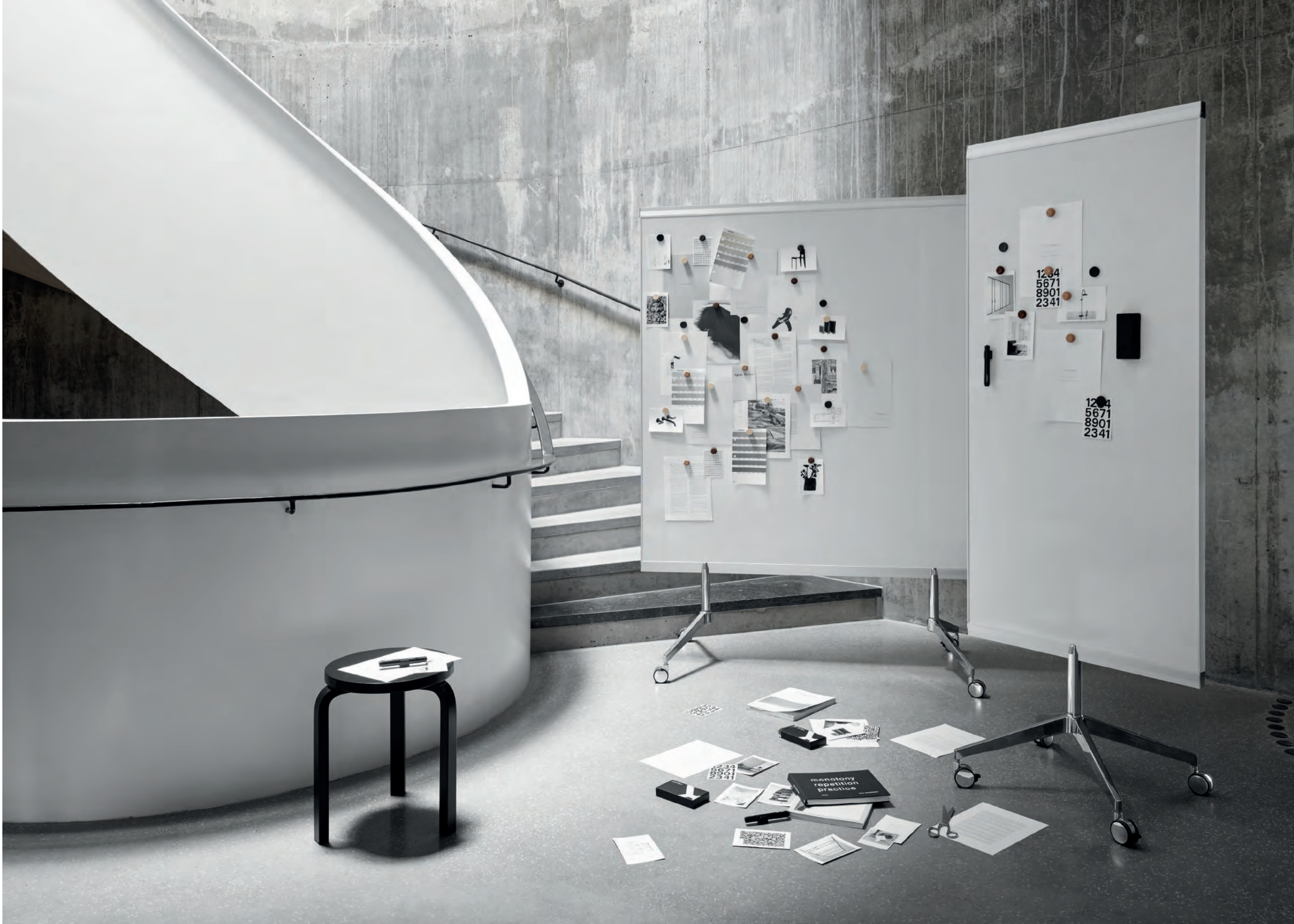
M3 mobile Double-sided mobile whiteboard available in two sizes.