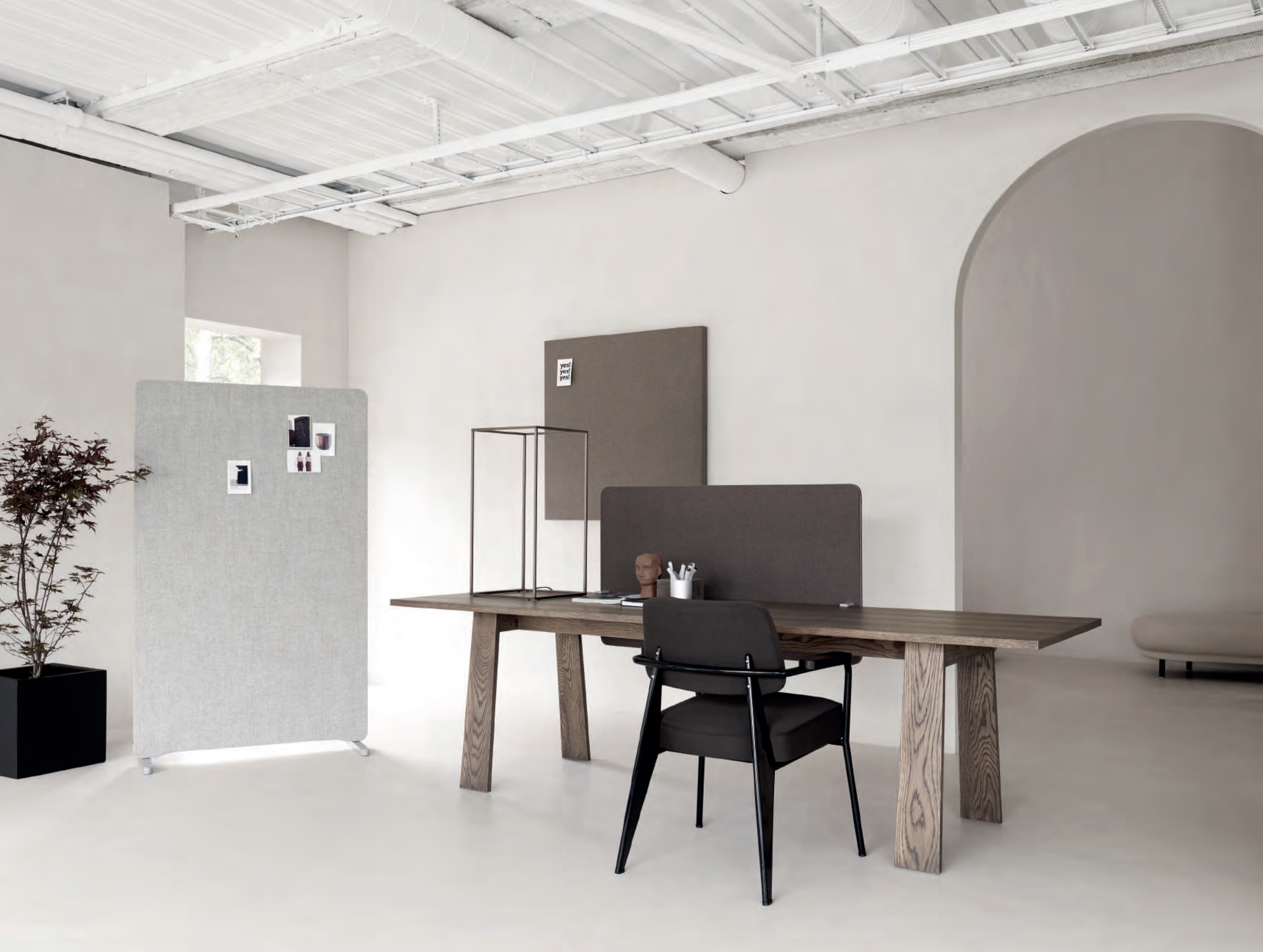
Edge floor Textile-covered floor screen with sound-ab- sorbing filling.