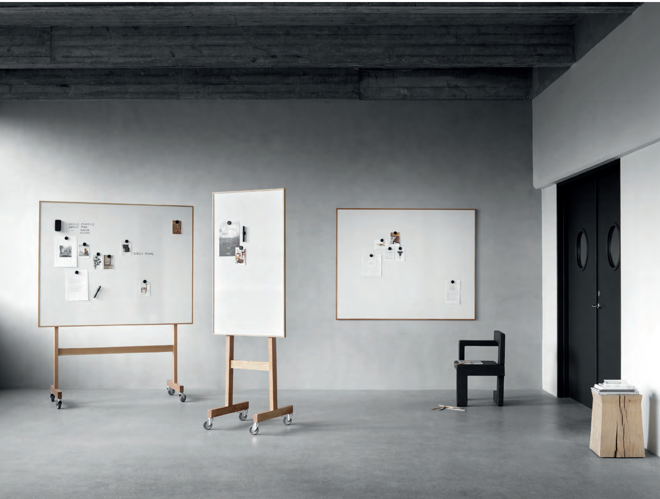
Wood Mobile whiteboard with a solid oak stand and oak veneer back.