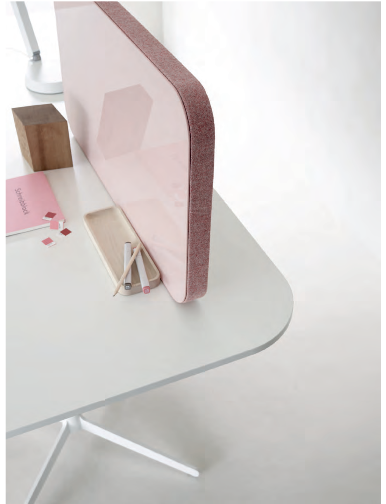
Form Meeting Function

Mood Fabric Glass writing board on one side, sound absorber on the other.