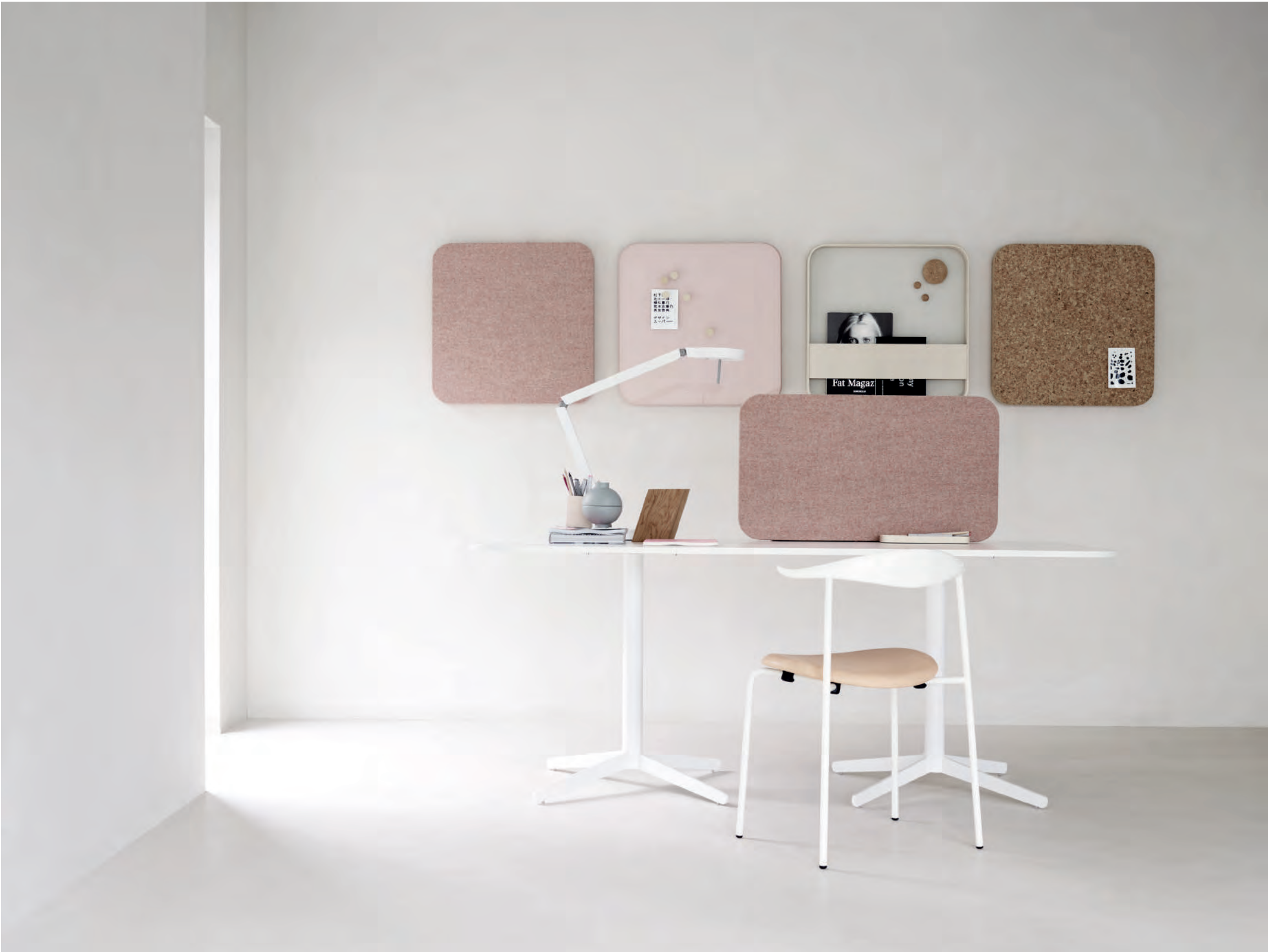
Mood Fabric table Glass on one side, textile on the other.