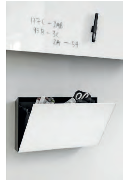
Mood Box Smart wall storage with glass front.