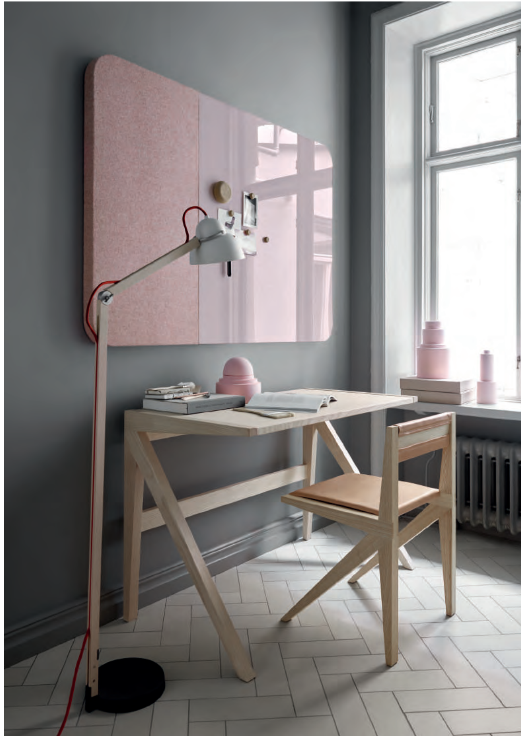
Mood Fabric wall Glass writing board with matching sound absorber available in several sizes and colourways.