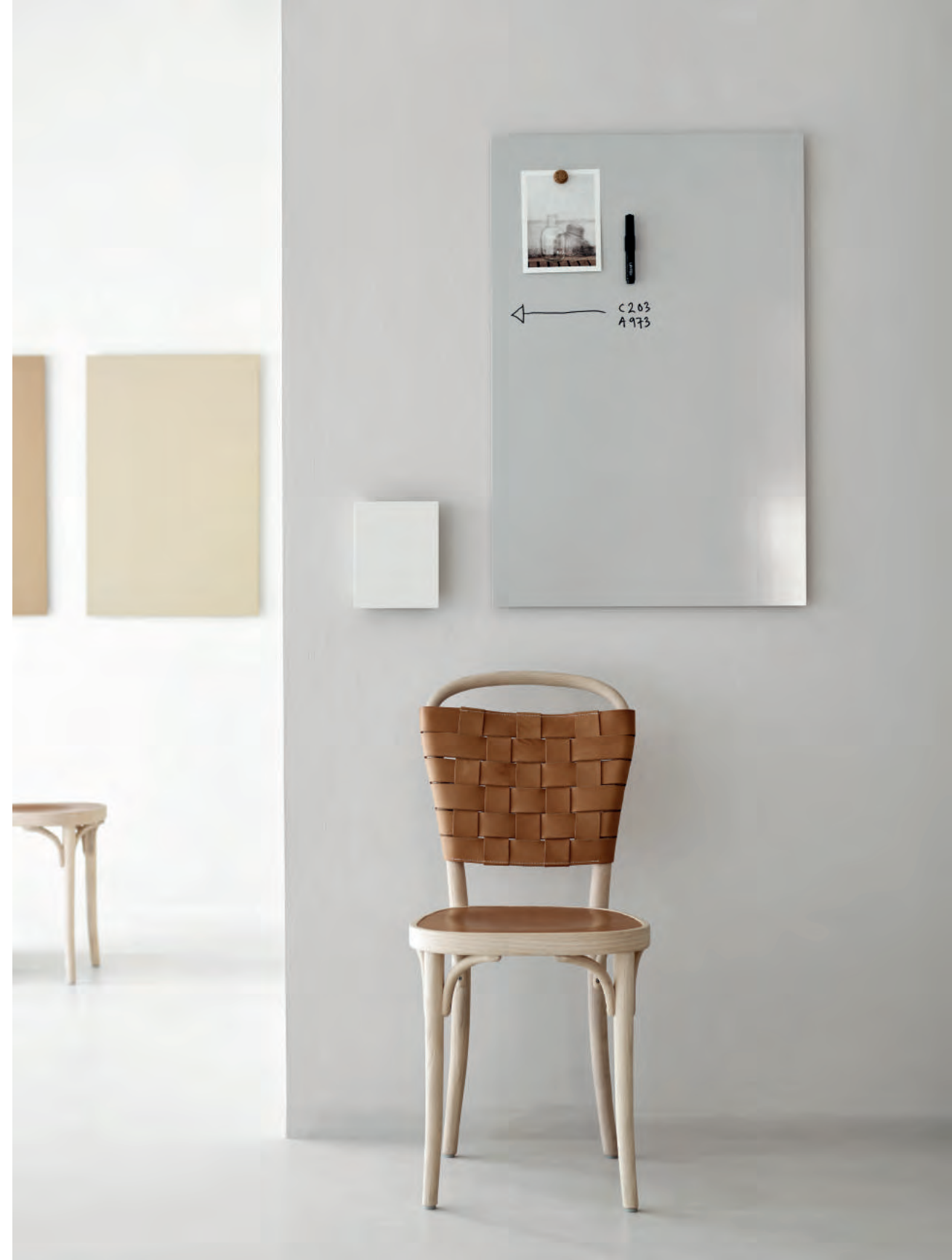
Air Pocket Smart storage for pens and eraser.