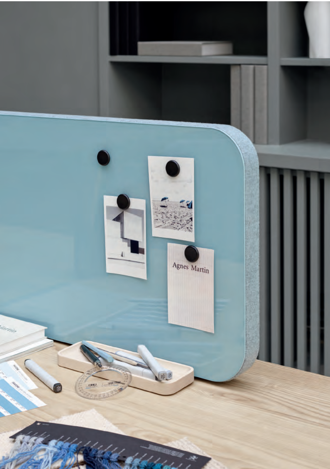
Mood Pocket Smart storage for pens and eraser.