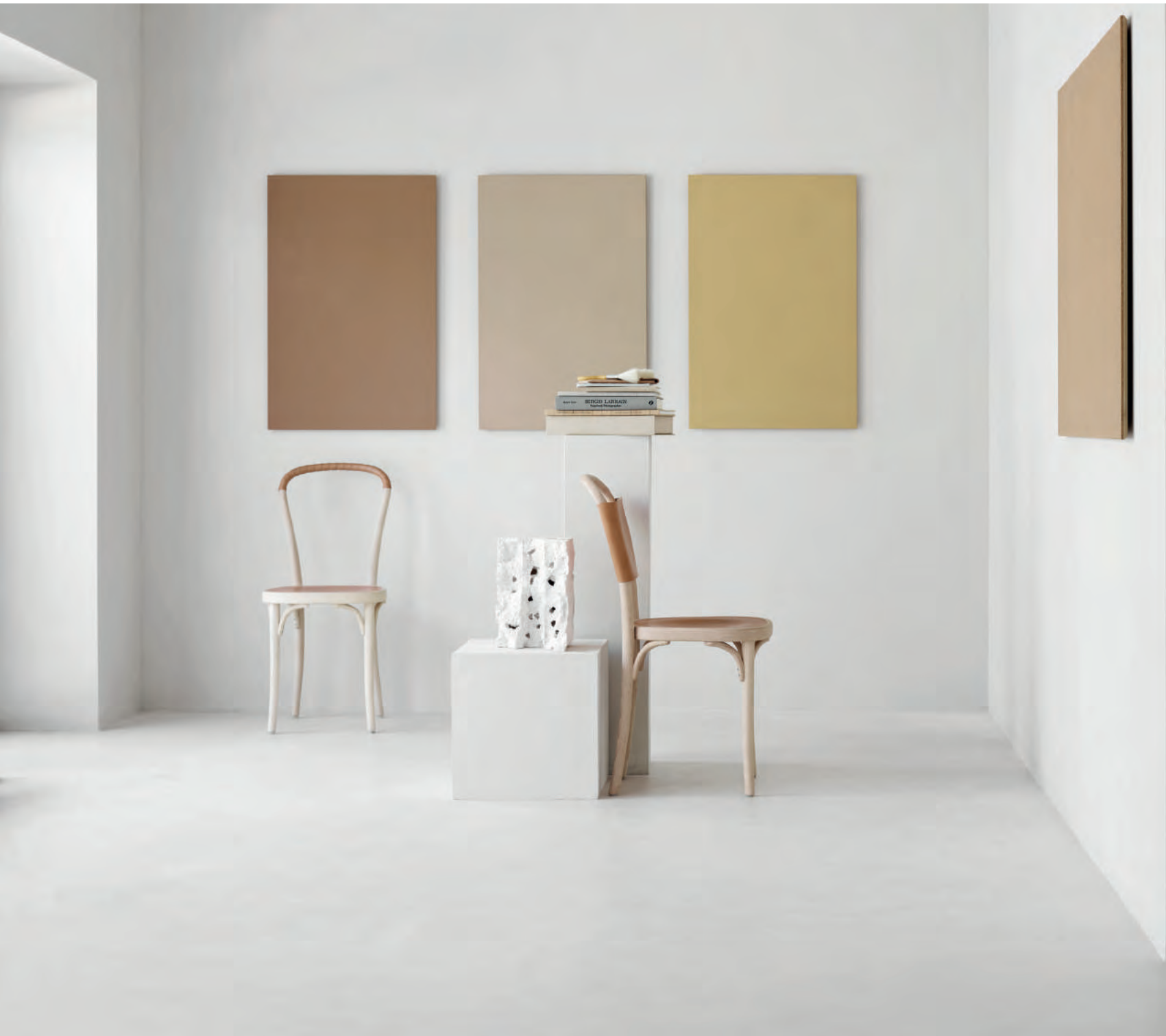
Air Bulletin Frameless noticeboard in several colours.