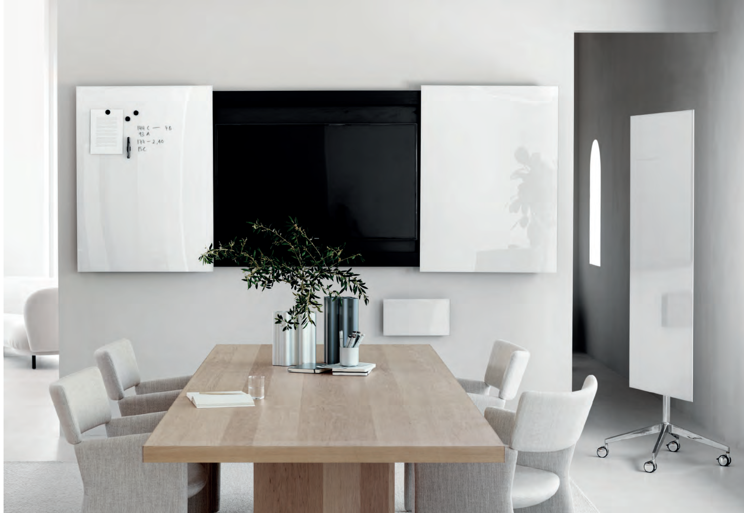
Mood Conference Conference cabinet with sliding glass doors which open to reveal a whiteboard or TV screen.