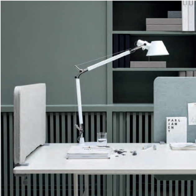
Edge table screen Top-mounted.