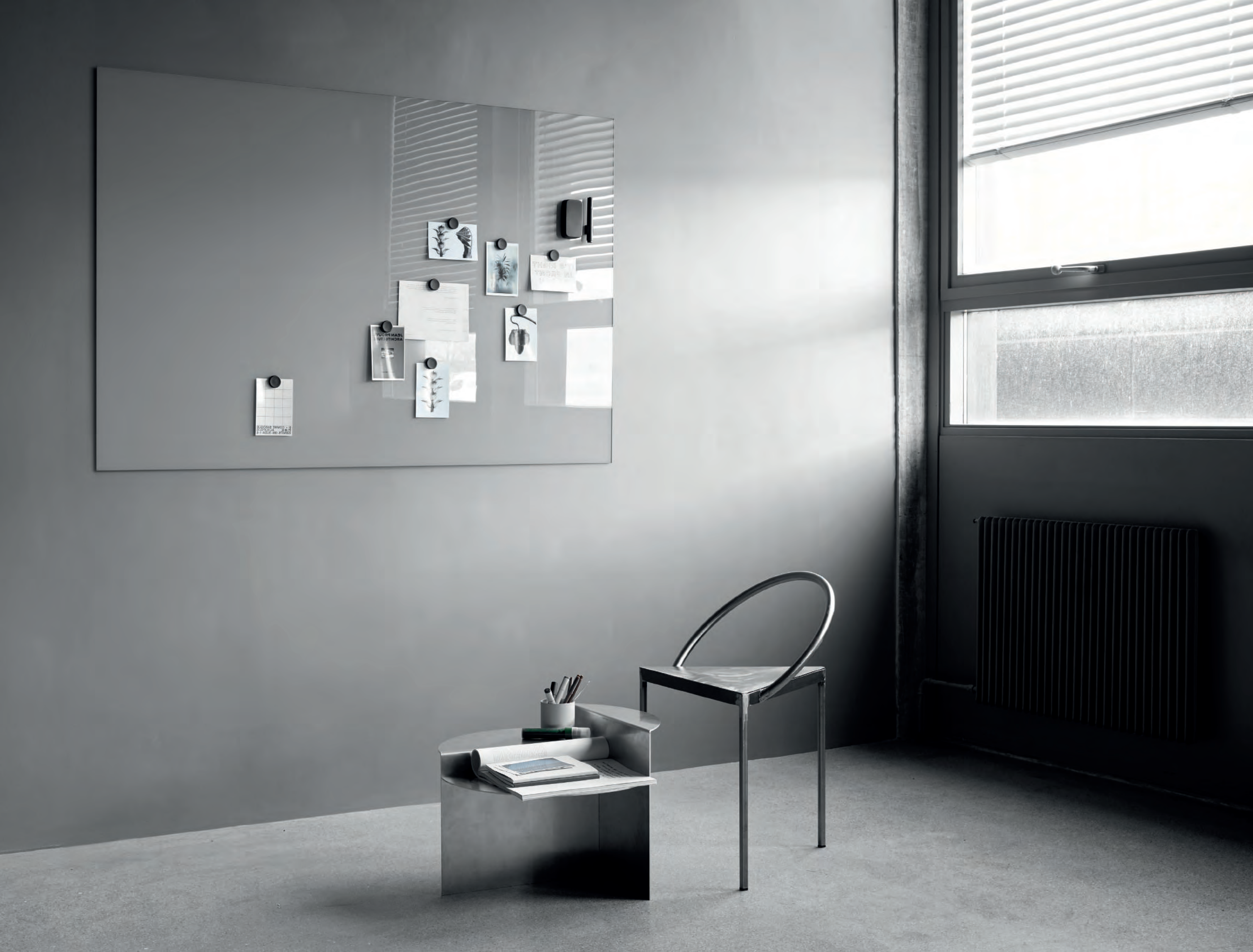
Mood Magnetic glass writing board.