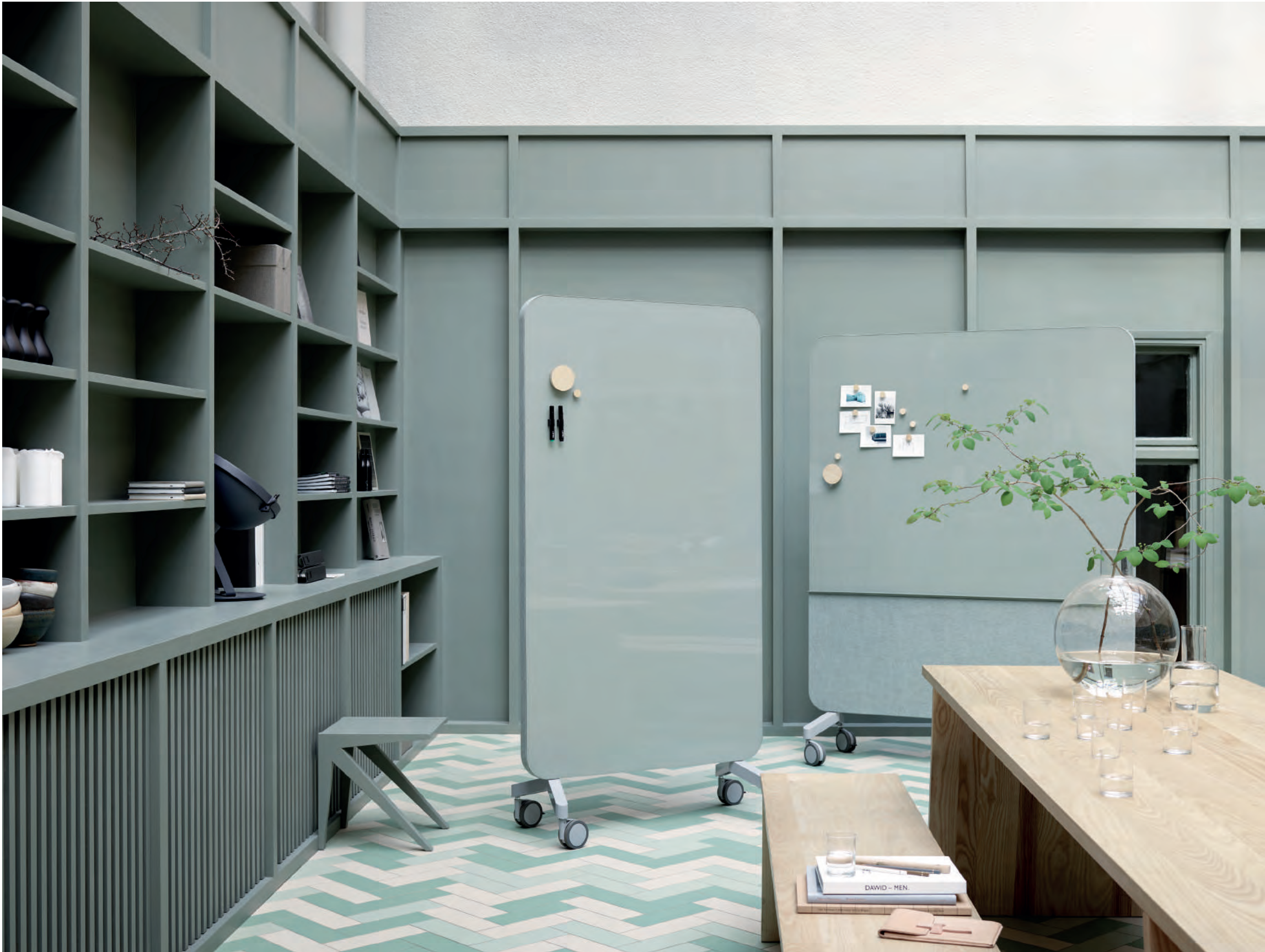
Mood Fabric Available in two sizes and several monochrome colour combinations.

Mood Fabric is a versatile screen that offers a seamless combination of materials and functions. A mobile glass writing board with a textile-covered, sound-absorbent back. A monochrome office screen for any professional space. Designed by Christian Halleröd and Matti Klenell. Available in two sizes and several colour combinations.