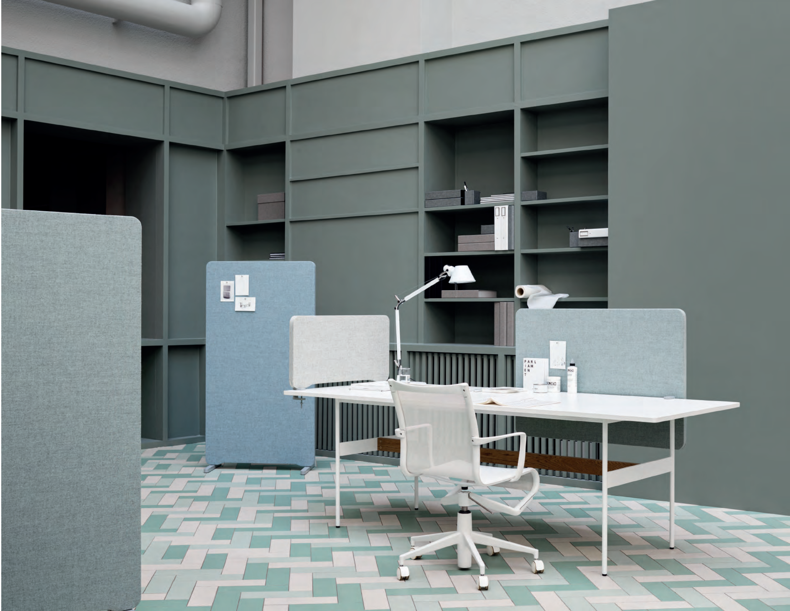
Edge table screen Front-mounted.