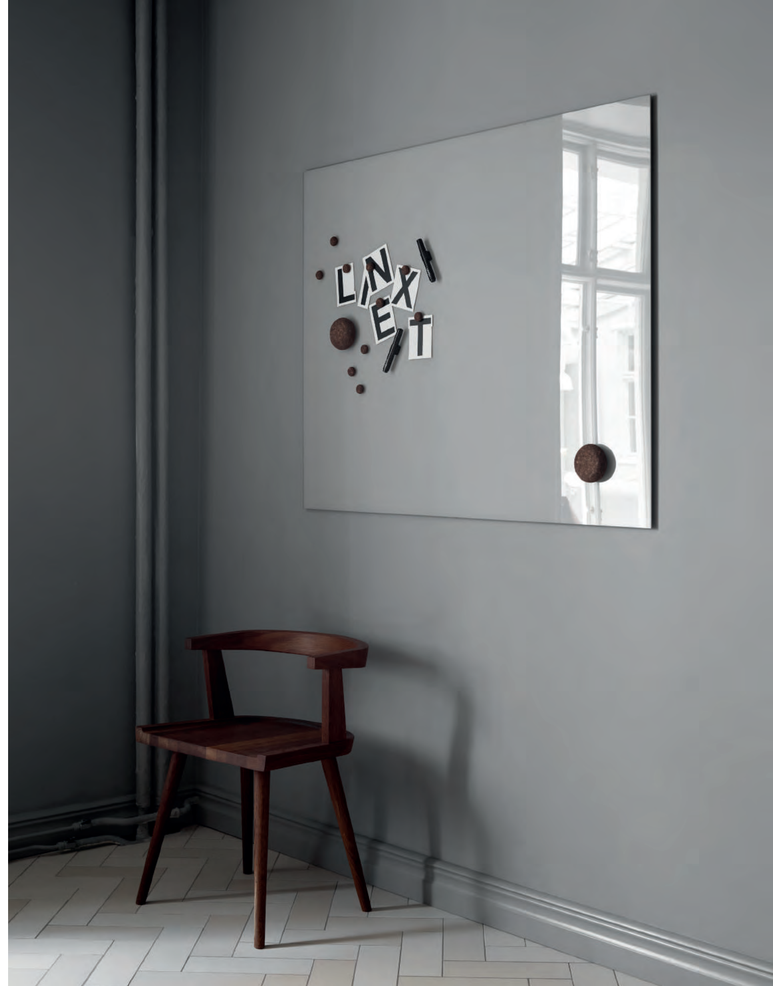
Mood Available in 24 colours.