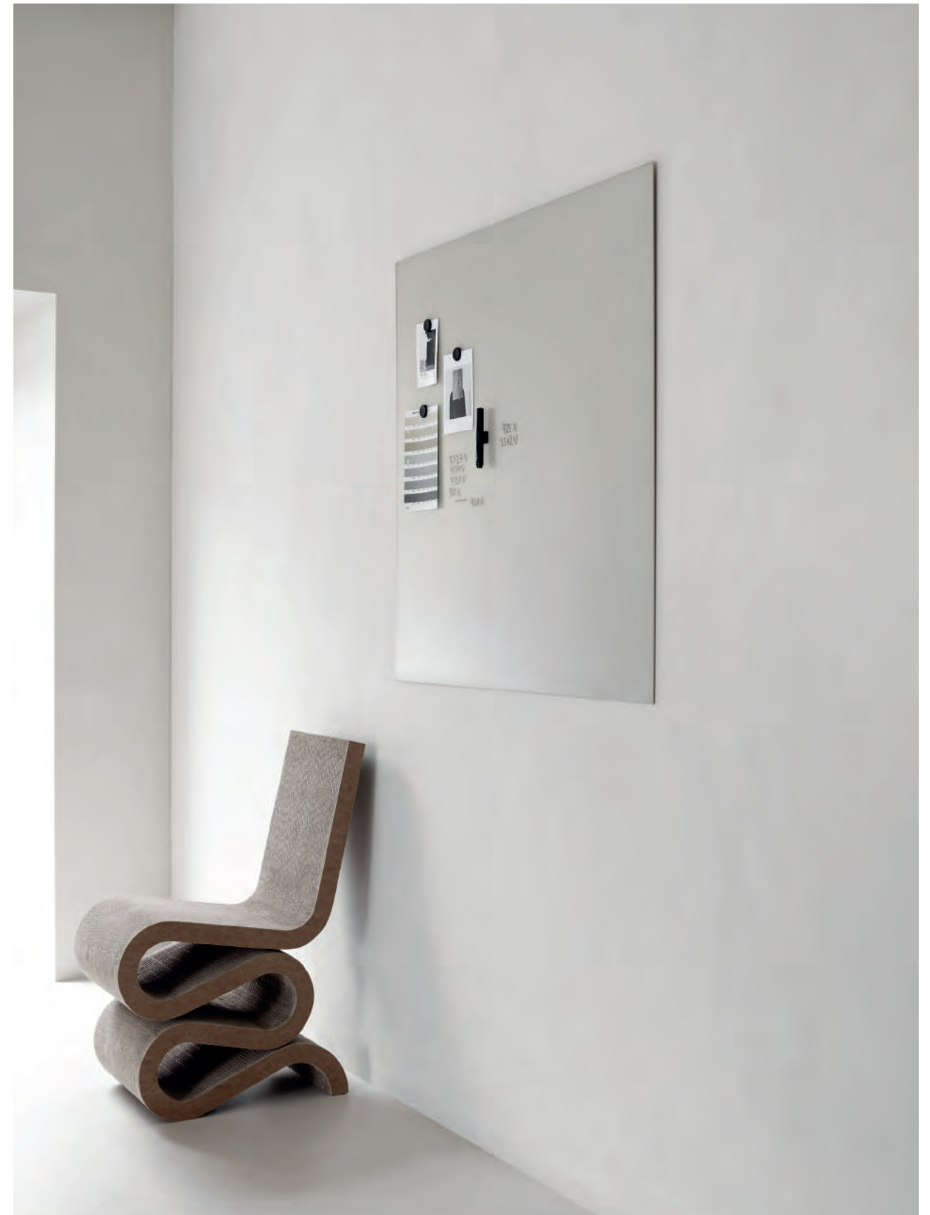
Form Meeting Function

Mood with silk-glass All-matt glass writing board.