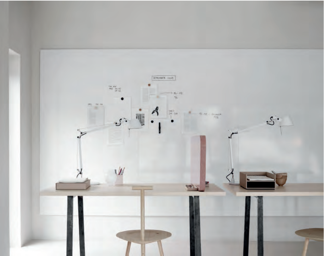
Air Spaces Create large continuous whiteboards.

Air Spaces allows you to construct large creative whiteboard walls for endless creativity and collaboration. Add a textile noticeboard or even a chalkboard for a more personal touch.