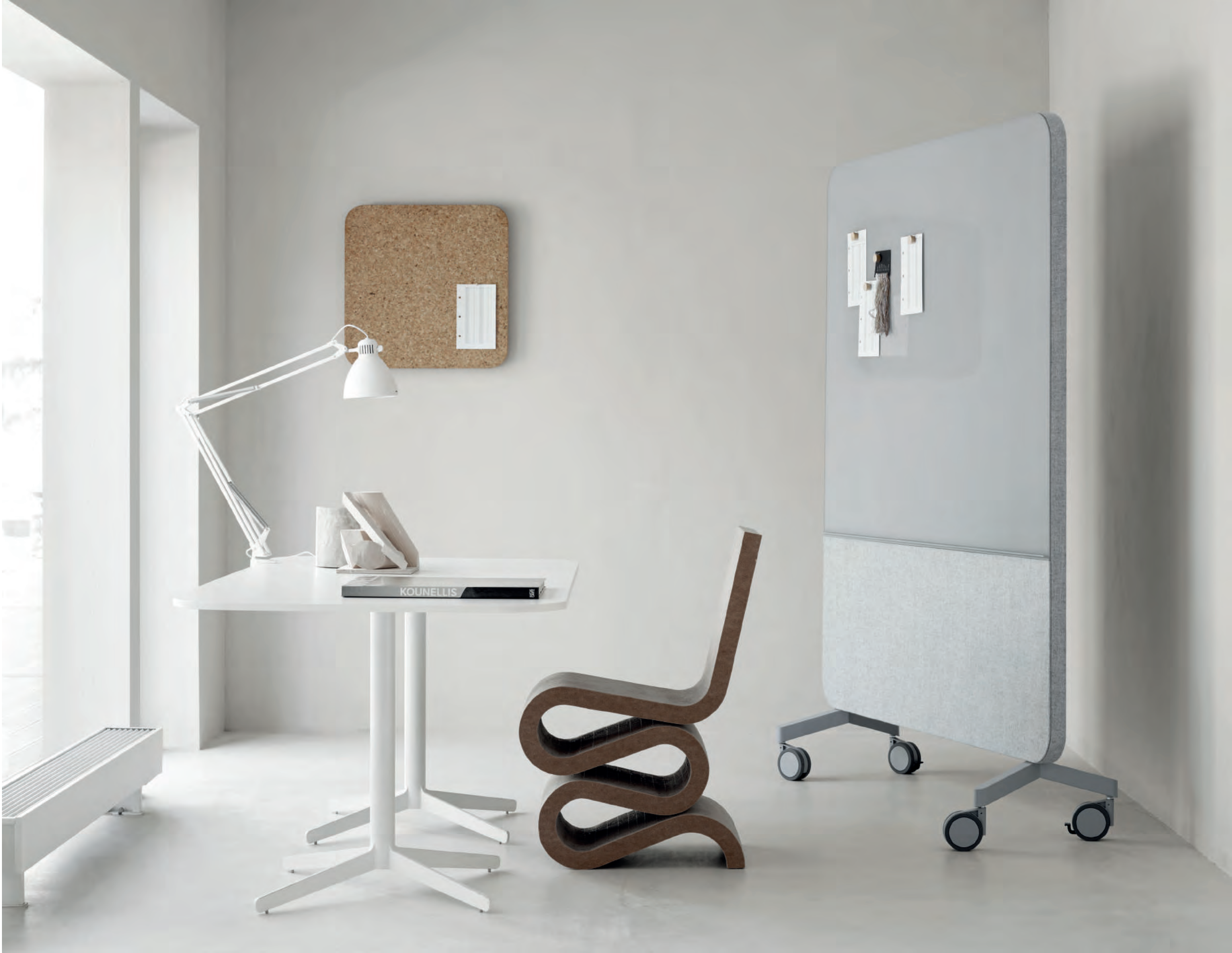
Mood Fabric Mobile glass writing board and sound absorber.